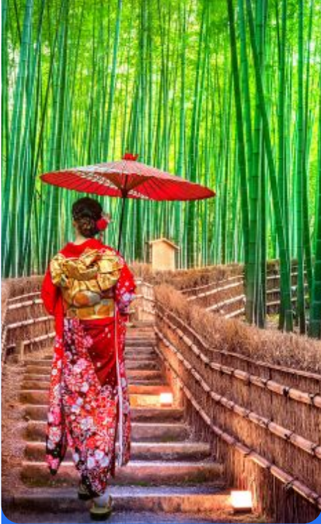
Arashiyama Bamboo Forest