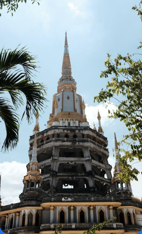
TIGER CAVE TEMPLE