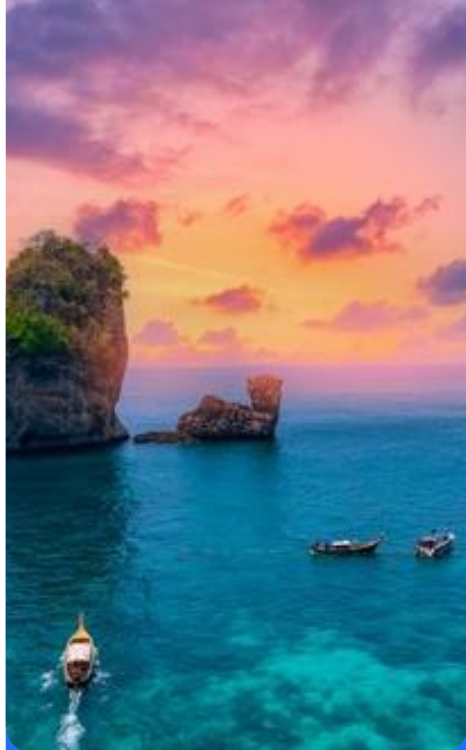
PHI PHI ISLAND