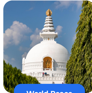
World Peace Stupa