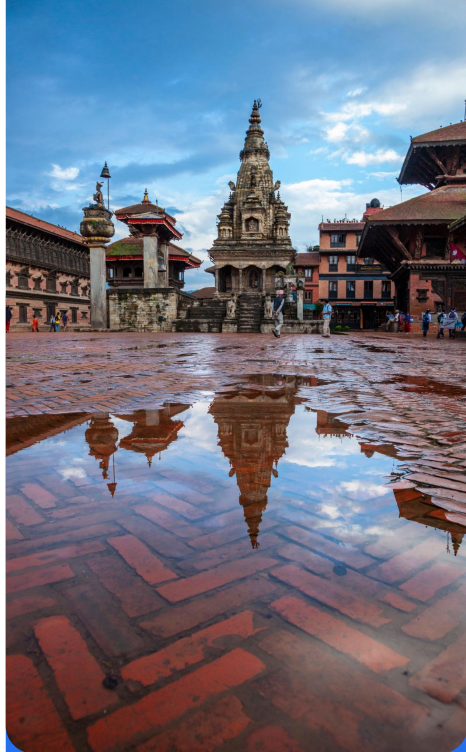
Bhaktapur Durbar Square