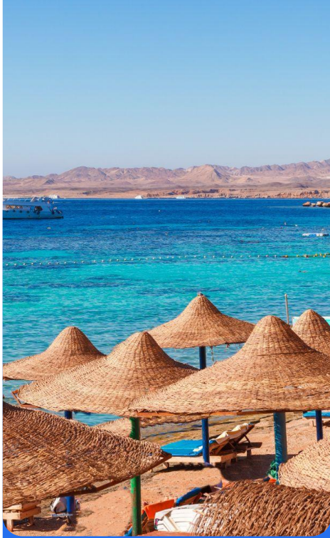
Speed Boat Ride at Red Sea