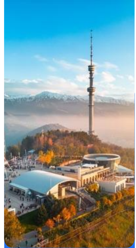
KOK TOBE HILL