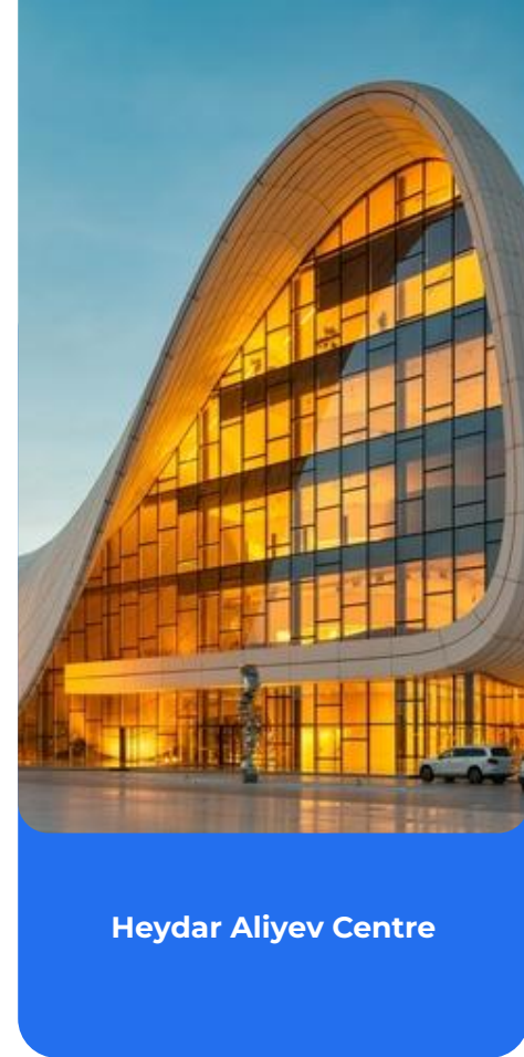
Heydar Aliyev Centre

*Note – Standard check-out time from your hotel will be at 12:00PM.