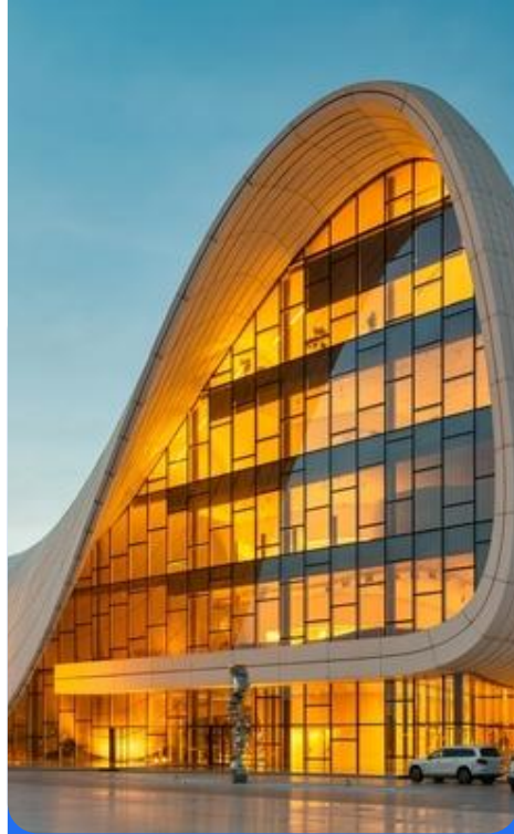
Heydar Aliyev Centre