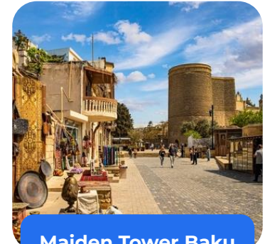
Maiden Tower Baku