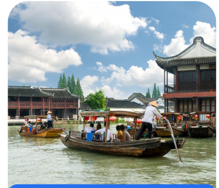
ZHUJIAJIAO WATER TOWN