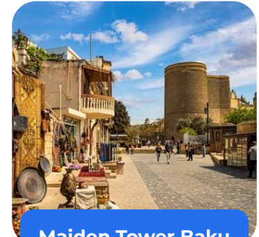
Maiden Tower Baku