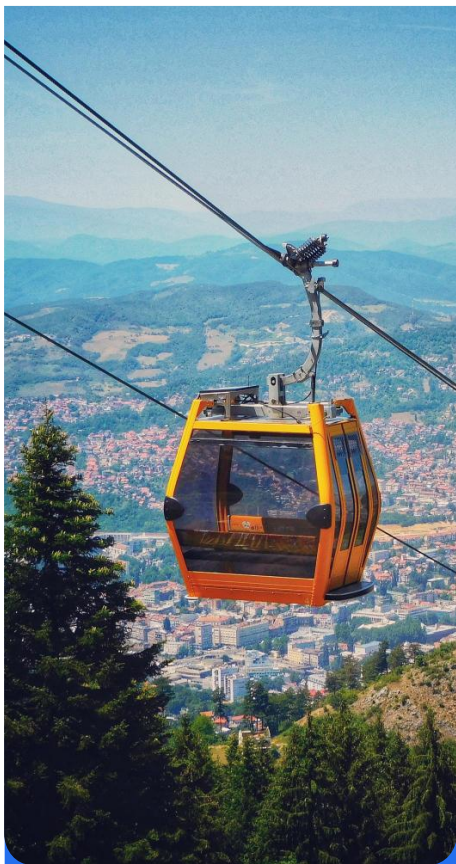
NARIKALA CABLE CAR