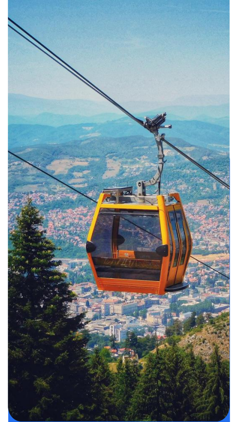
NARIKALA CABLE CAR