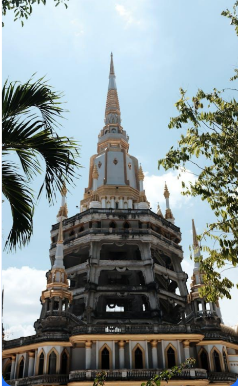
TIGER CAVE TEMPLE