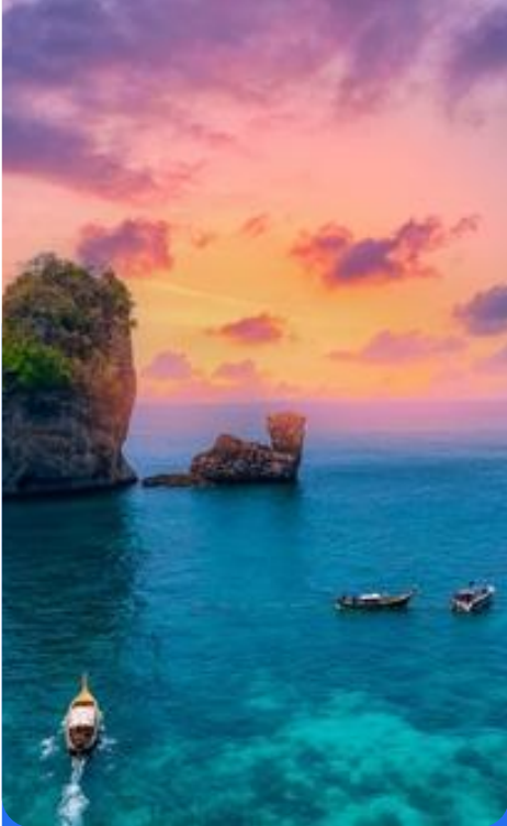
PHI PHI ISLAND