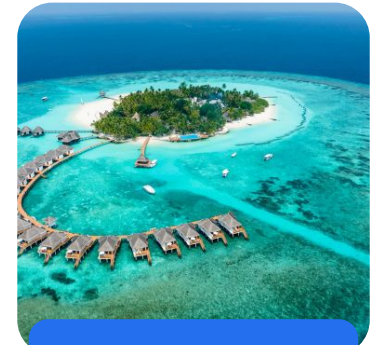
Marine Adventures in Red Sea