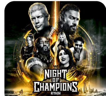
WWE Night Of Champions