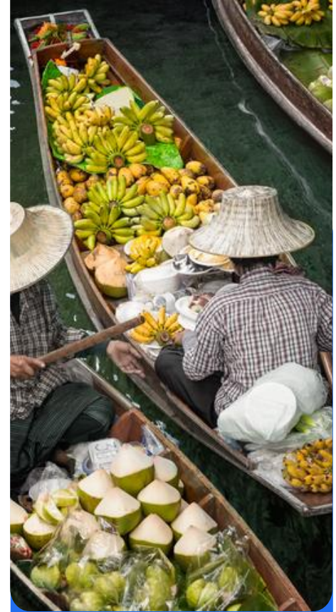
PATTAYA FLOATING MARKET