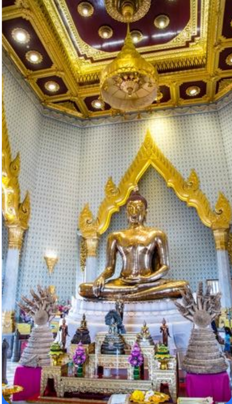
GOLDEN BUDDHA TEMPLE